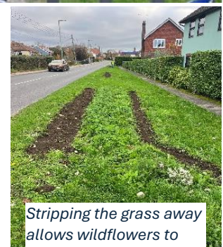
Stripping the grass away allows wildflowers to establish.

My thanks go to the hard work of the Greener Fram team, who put so much of their personal time in to make this initiative a success.