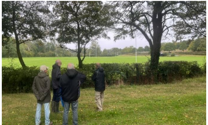
On a catchment walk, FFRWG members looking southward towards Framlingham Town and Mere. The gentle drop in elevation towards the town can be seen clearly from this vantage point.

ESC webinars continue to support Emergency Preparedness and Building Community Resilience, with follow up in-person workshops. The aim is to provide an opportunity for Community Emergency Planning Groups (CEPGs) to develop. The sessions are designed for those thinking of