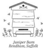
Juniper Barn Rendham, Suffolk