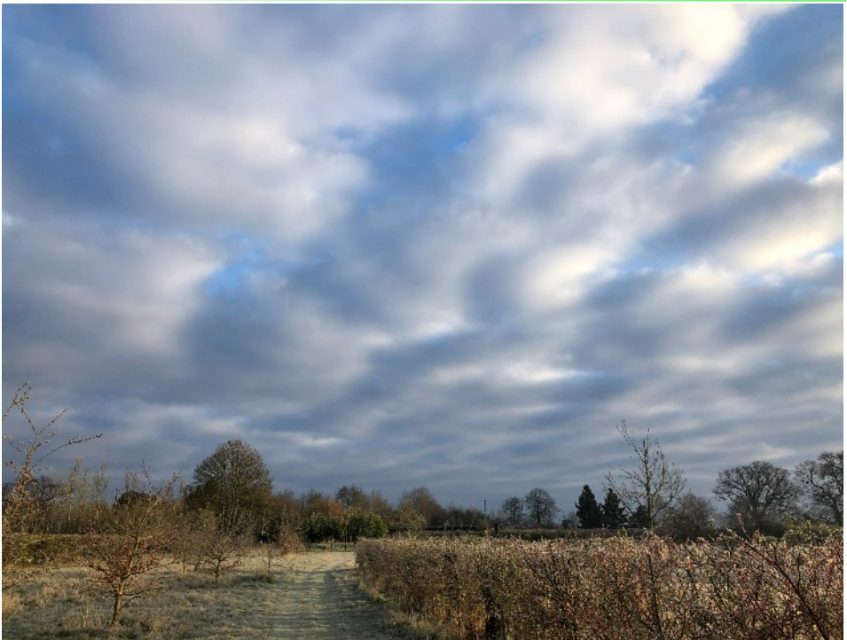
This photo of an incredible Rendham sky was taken on 1 April 2024.

Read it in colour ONLINE at : https://rendham.onesuffolk.net