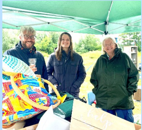
All photos of minors reproduced by kind permission of their families.