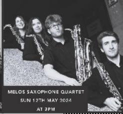
MELOS SAXOPHONE QUARTET SUN 12TH MAY 2024 AT 3PM