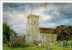
Watercolour: Tory Lawrence, 2012

The Friends of St Michael's, a secular charity established in 2009 to raise funds to help preserve the fabric of the church, has decided to take the required steps to wind up the charity. The residual capital of the charity is about £6,000 and it will be transferred to Rendham Parochial Church Council with the stipulation that this money should be used on the fabric of the building.