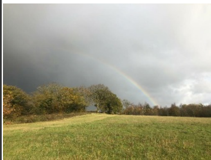
The landscape of native and naturalised trees on a November morning in Rendham, taken at the same time from a single spot, looking northwest and looking northeast