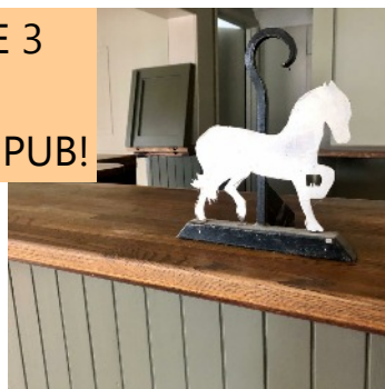
Above: Rendham White Horse on the new bar