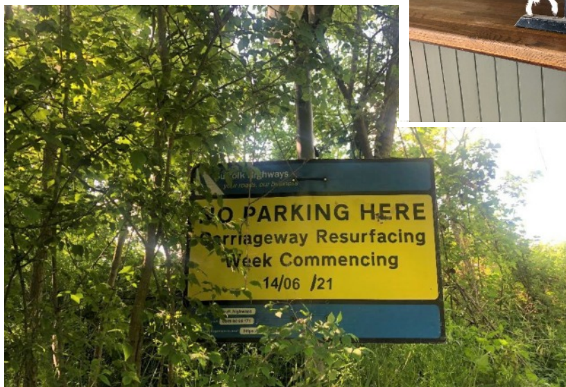
Left: An informative notice on one of Rendham's busiest roads

Supported by Rendham Village Amenity Fund Reports, editing, distribution by volunteers. Printers: Leiston Press